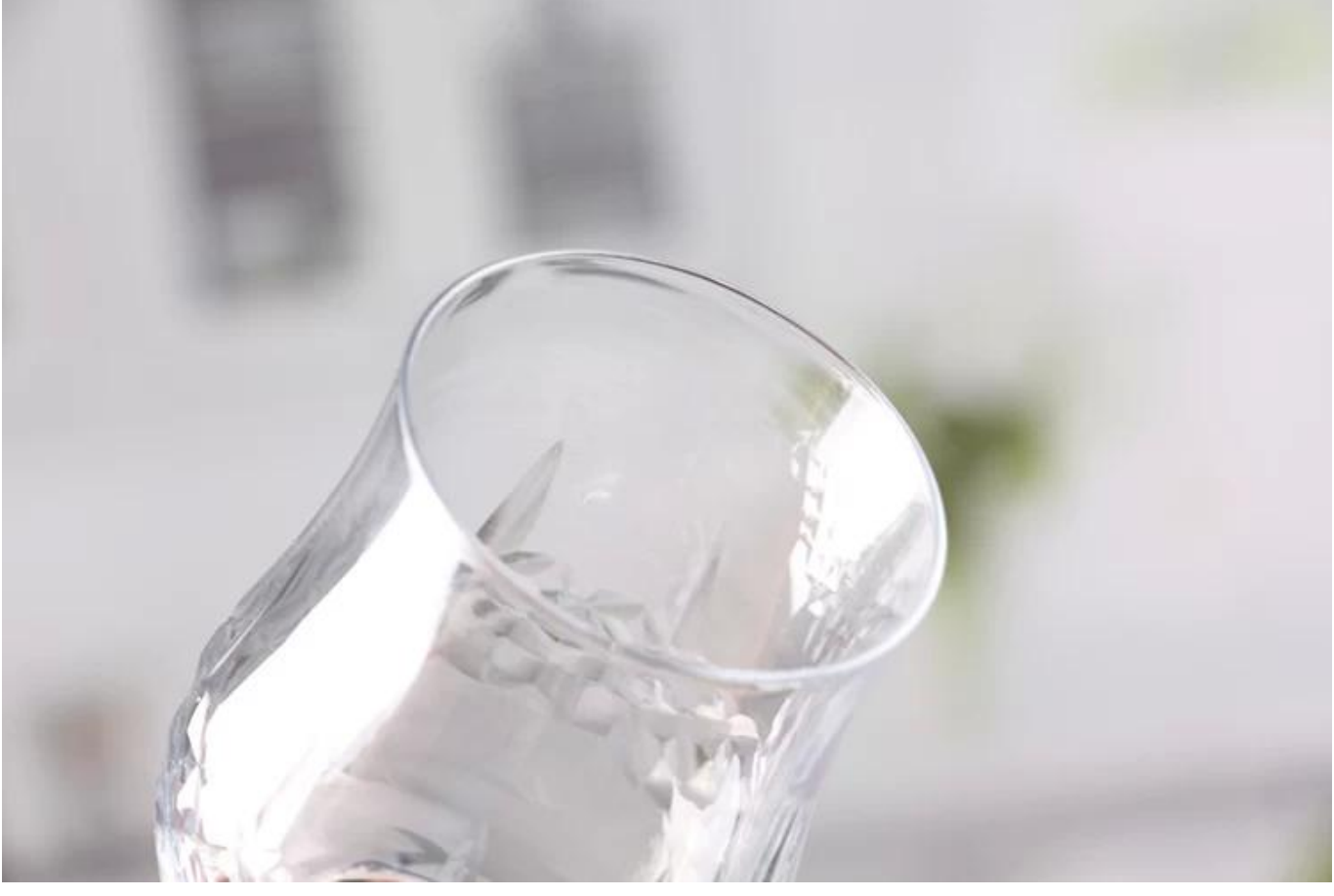
Short Wine Glass Set