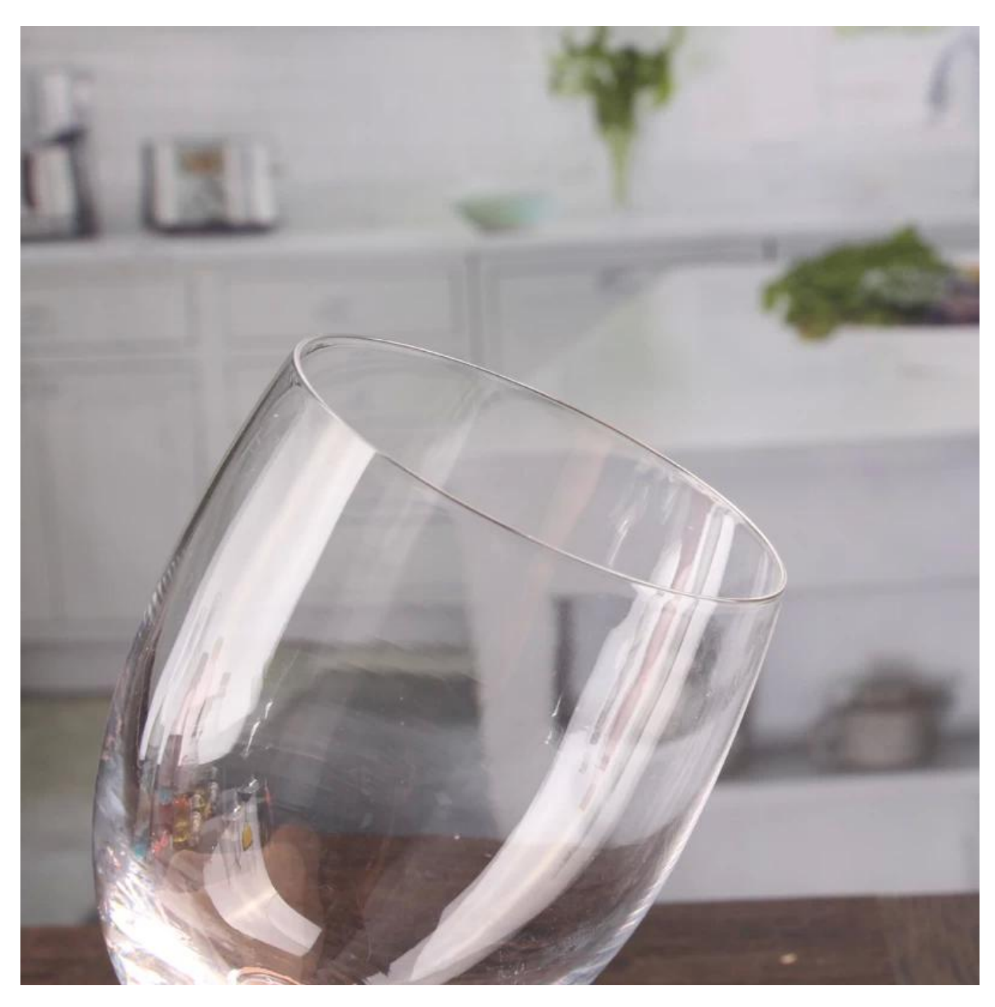
300ml pyrex short stem wine glass manufacturer