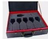
N. Gift Box