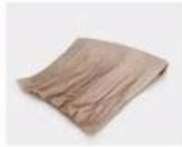
B. Corrugated paper