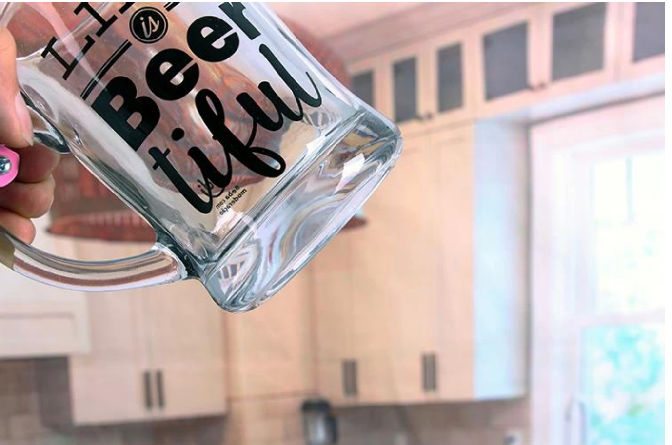
Beer Mug With Bell