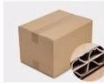
G. Five layer Corrugated paper master carton