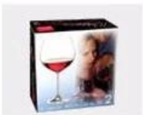
K. Color Box