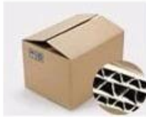
H. Seven layer Corrugated paper master carton