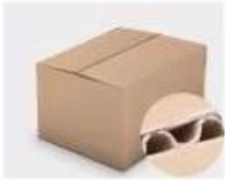
F. Three layer Corrugated paper master carton