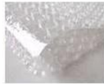
C. Bubble paper