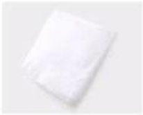
A. White paper