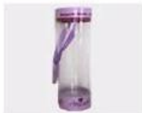
M. Pvc Box