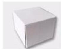
J. White Box