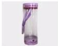
M. Pvc Box