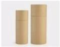
L. Paper Sleeve