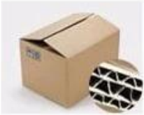
H. Seven layer Corrugated paper master carton