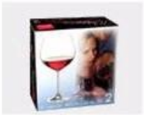
K. Color Box