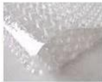
C. Bubble paper