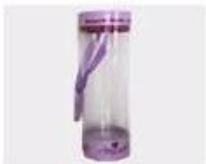
M. Pvc Box