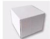
J. White Box