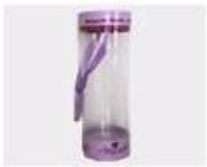
M. Pvc Box