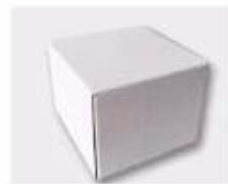
J. White Box