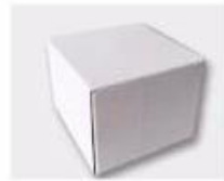
J. White Box