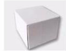
J. White Box