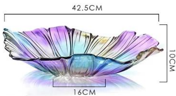
Large glass fruit plate