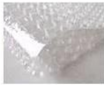
C. Bubble paper