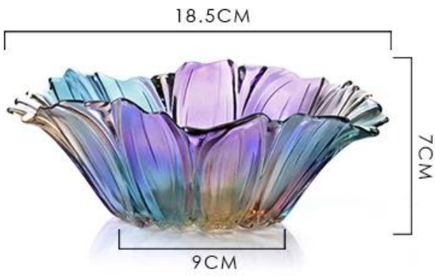
Small glass fruit bowl