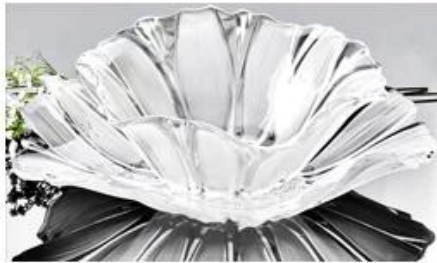
【 Silver 】