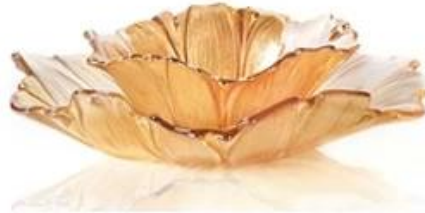
【 Gold 】