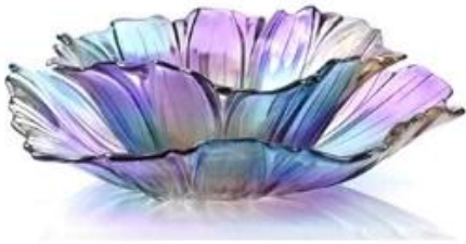
【 Bright 】