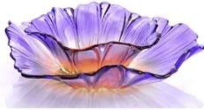
【 Purple 】