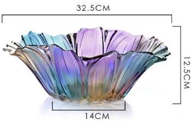
Large glass fruit bowl