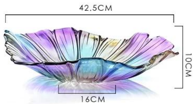
Large glass fruit plate