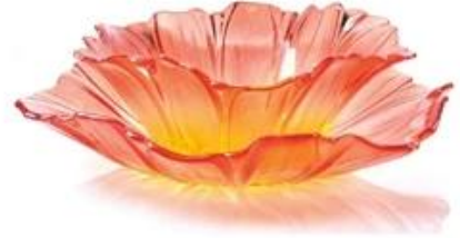
【 Red 】