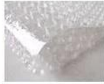
C. Bubble paper